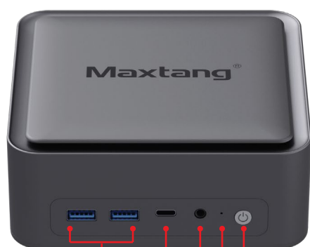
2x USB3.2 USB-C(USB3.2_10Gb) Audio Power Button CLR_CMOS